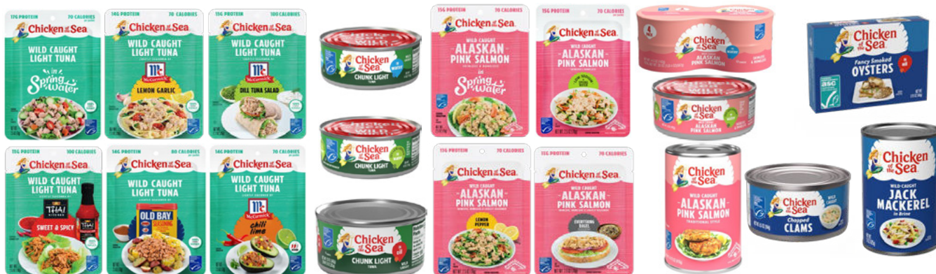
*tuna and salmon products included above are examples & not the full lineup