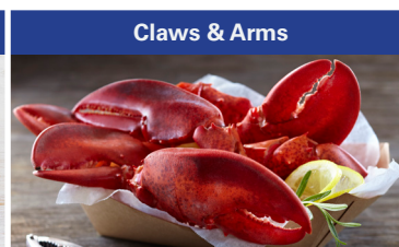
Claws & Arms

All-lobster, no fuss, and ready-to-eat! Great for back of the house and convenient for grab-and-go. Efficiency in labor costs, waste reduction, and portion control.